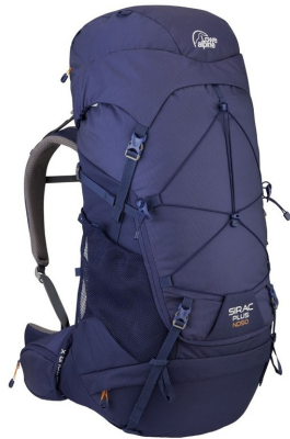
Sirac Plus Women's (ND)

Sturdy hiking pack made ready for multi-day trekkers and backpackers. Front and lower entry gives you easy access to the convenient storage features and your full kit. In tandem with the AirContour X back system, you can comfortably carry your gear for days on end.