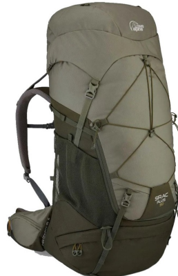
Sirac Plus Men's