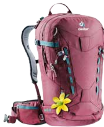
DEUTER FREERIDER PRO 28SL $319.95

Fabric 420D PA Ripstop Clear TPU, 330D PA 6.6 Ripstop