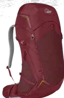
LOWE ALPINE AIRZONE TREK ND33:40 $339.95

A fully featured top-loader that has all the features you'd expect in a modern pack. Designed for trekking, it has a well-ventilated back system and multiple access points so you can find your gear on the go.