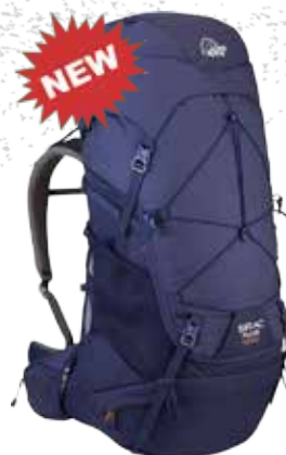
LOWE ALPINE SIRAC PLUS ND50 $269.95

Featuring the comfortable and lightweight Air Contour™ X back system, this robust, convenient 50L pack is perfect for keeping you organised on first-time backpacking adventures or hut-to-hut missions.