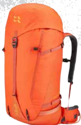
RAB ASCENDOR 35:40 $279.95

Take on technical day hikes or overnights that need your bivi with this adaptable pack. Whether climbing, mountaineering or trekking, the flexible Ascendor gives your gear protection while remaining comfortable on your back.