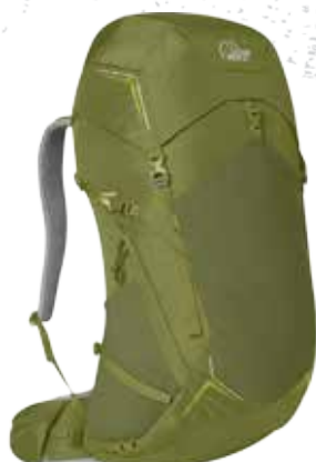
LOWE ALPINE AIRZONE TREK 45:55 $359.95