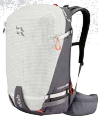
RAB KHROMA 30 $349.95

Spectra® fibres are 15 times stronger than steel for their relative weight and is sewn throughout the Khroma. Take on rugged winter terrains with your skis or snowboard with this diagonal or A-frame carry-capable pack.