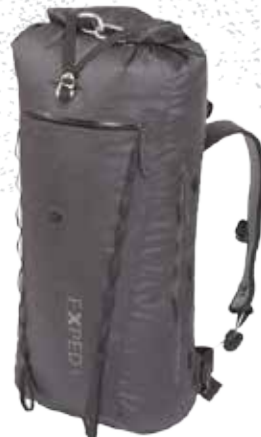
EXPED SERAC 45 $369.95

Fabric 210D Cordura with Spectra® Ripstop, Hydroschild Dura and 50% Recycled 420 PW, Hydroschild