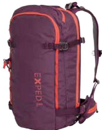
EXPED GLISSADE 35 $249.95

Also available: COULOIR 40 $359.95 COULOIR 40 WMS $359.95