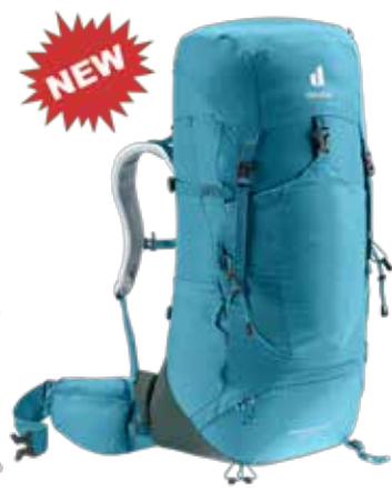
DEUTER AIRCONTACT LITE 35+10SL $369.95

Sleek packs remain true to their lightweight credentials. Minimal weight with a purist, technical look make AirContact Lite light, yet reliable.