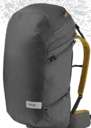
RAB ROGUE 48 $249.95

Fabric 840D ballistic nylon and 420D nylon