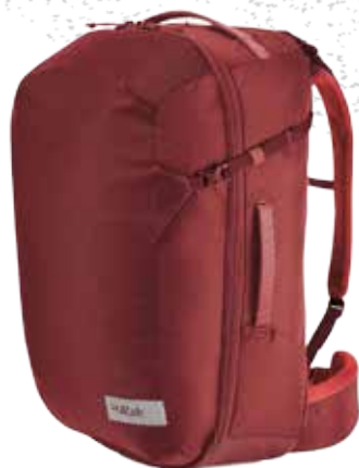
RAB OUTCAST 44 $239.95

With its book-style opening, you can get to your gear while on the move. Robust and durable bag with reinforcement in high-wear areas.