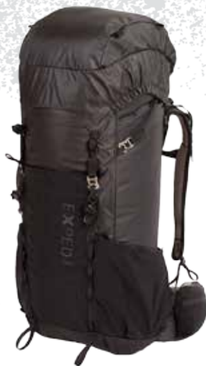
EXPED THUNDER 50 $419.95

Reimagined version of the Lightning, with extra features and gear storage options. A fully featured backpack on an ultralight frame.