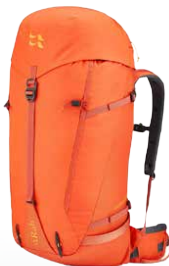
Rab Ascendor 35:40, mountaineering pack.