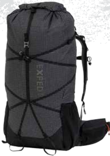
EXPED LIGHTNING 45 $339.95

Featherweight top-loader pack with excellent motion control. Roll-top closure protects your gear.