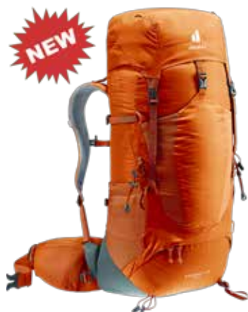
DEUTER AIRCONTACT LITE 40+10 $369.95