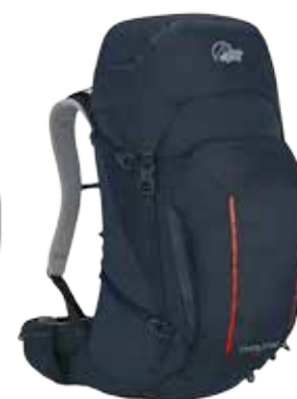
LOWE ALPINE CHOLATSE ND40:45 $349.95

Lowe Alpine's redesigned Air Contour+ carry system with an adjustable one-piece scapula gives a snug, stable fit that moves with your body. Rough ripstop nylon makes up this top-loader, made for advanced day hiking and trekking.