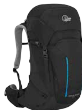
LOWE ALPINE CHOLATSE 42:47 $349.95