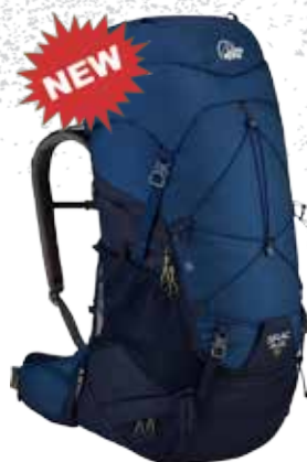
LOWE ALPINE SIRAC PLUS 50 $269.95

Multiple volumes available ND sized for women's fit Fabric 210D Mini Ripstop / HydroShield