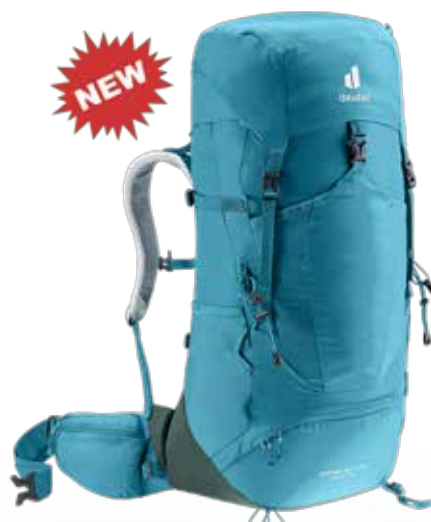
Deuter Aircontact Lite 35+10SL, a technical trekking pack.

The Mont Sentinel in use in the Dolomites, Italy