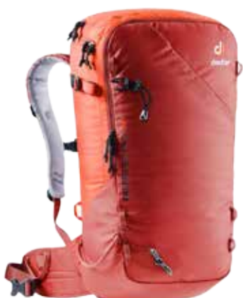
DEUTER FREERIDER PRO 34+ $359.95

Fabric B400 D HD ripstop nylon, TPU film laminated