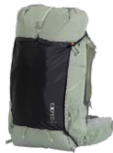
EXPED FLASH PACK POCKET $29.95

A lightweight outer pocket that can be added to the Exped Lightning Packs.