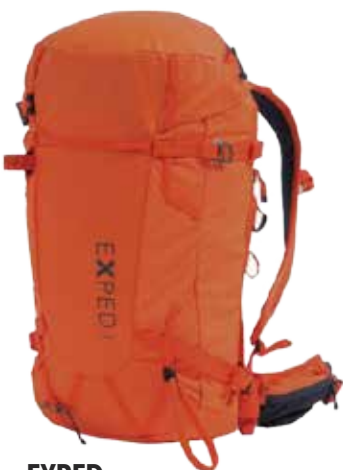
EXPED COULOIR 30 $339.95

Versatile pack capable of ski adventures but made to handle anything. Practical zippers, top lid pocket, back access, numerous compartments and extra straps for gear make up this comfy carrier.