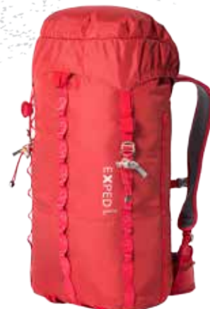
EXPED MOUNTAIN PRO 30 $449.95

Fabric B400 D HD ripstop nylon, TPU film laminated