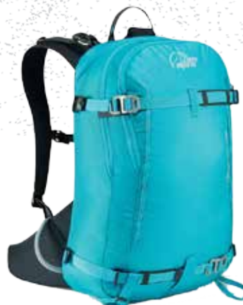
LOWE ALPINE DESCENT ND23 $209.95

Fabric 210D Cordura with Spectra® Ripstop, Hydroschild Dura and 50% Recycled 420 PW, Hydroschild