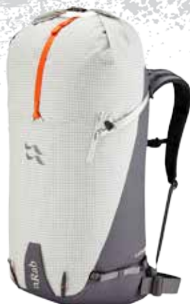
RAB LATOK 38 $329.95

Also available: RAB ASCENDOR 45:50 $299.95